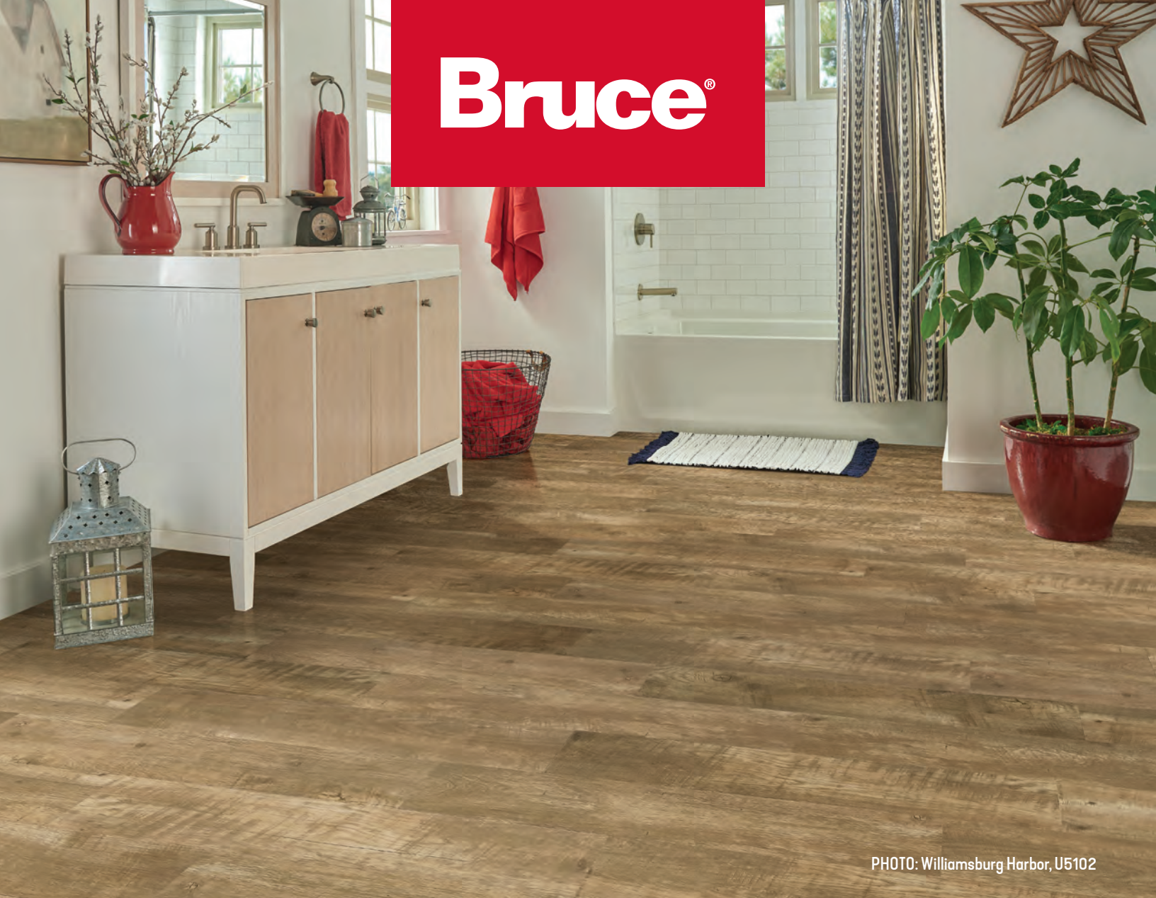
PHOTO: Williamsburg Harbor, U5102