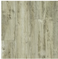
Monroe Hall 6 mil: U5109 12 mil: U7109