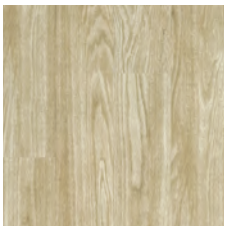
Boston Oak 6 mil: U5101 12 mil: U7101