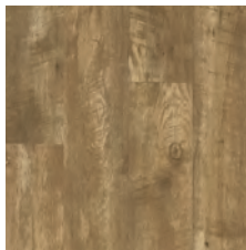
Williamsburg Harbor 6 mil: U5102 12 mil: U7102