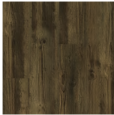
Lincoln Cabin 6 mil: U5110 12 mil: U7110