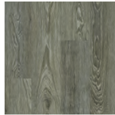
Albany Fort 6 mil: U5112 12 mil: U7112