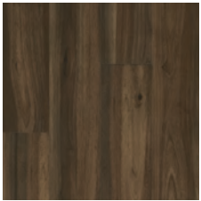
Jamestown Walnut 6 mil: U5105 12 mil: U7105